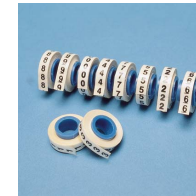
PMDR - * - *